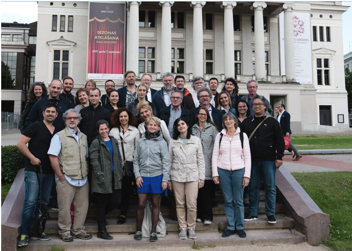
The project partners and invited external experts during Workshop I in Riga.